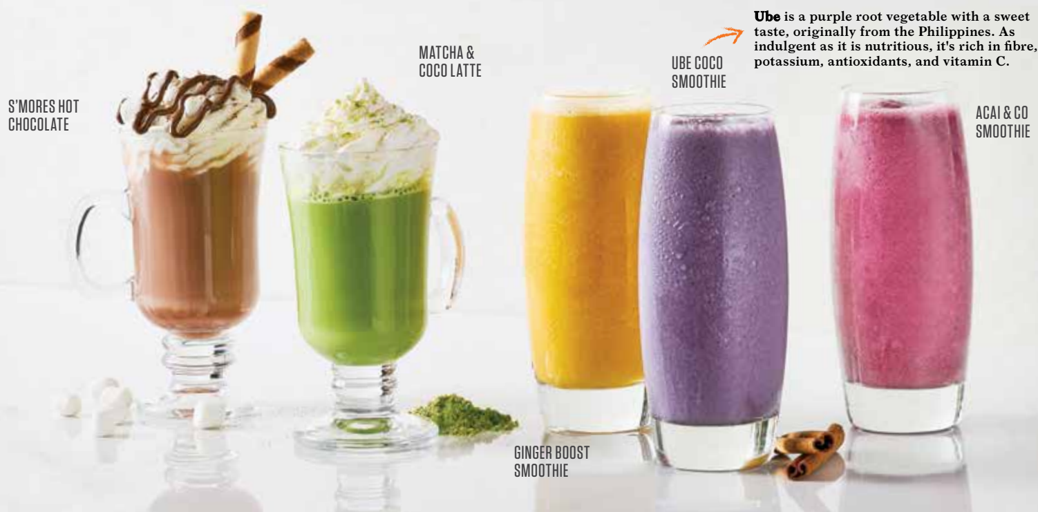
S'MORES HOT CHOCOLATE