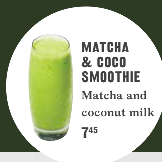
MATCHA & COCO SMOOTHIE Matcha and coconut milk 7 45

PLANT-BASED MILK Available at participating restaurants. Replace your regular milk with almond or oat milk.