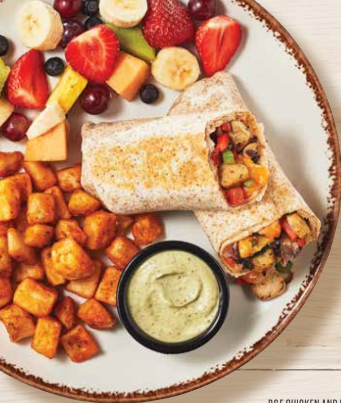
B&F CHICKEN AND PARMESAN SAUSAGE WRAP