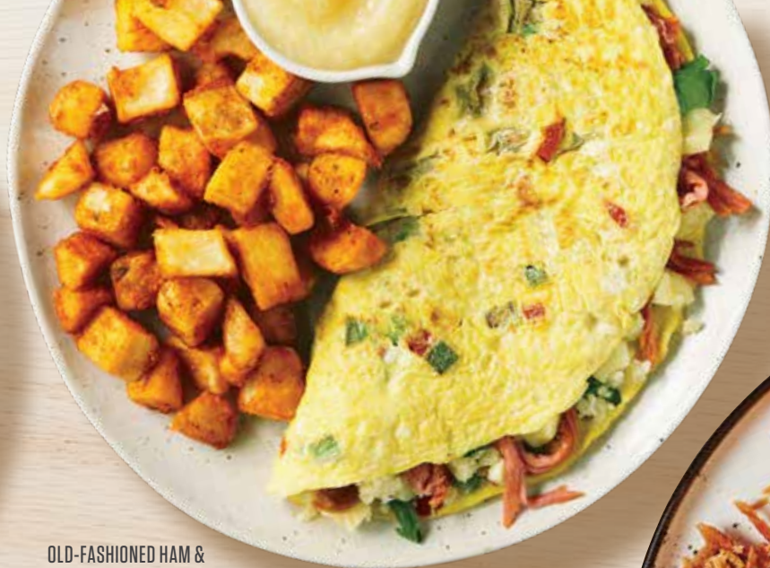
OLD-FASHIONED HAM & CHEESE CURDS OMELET