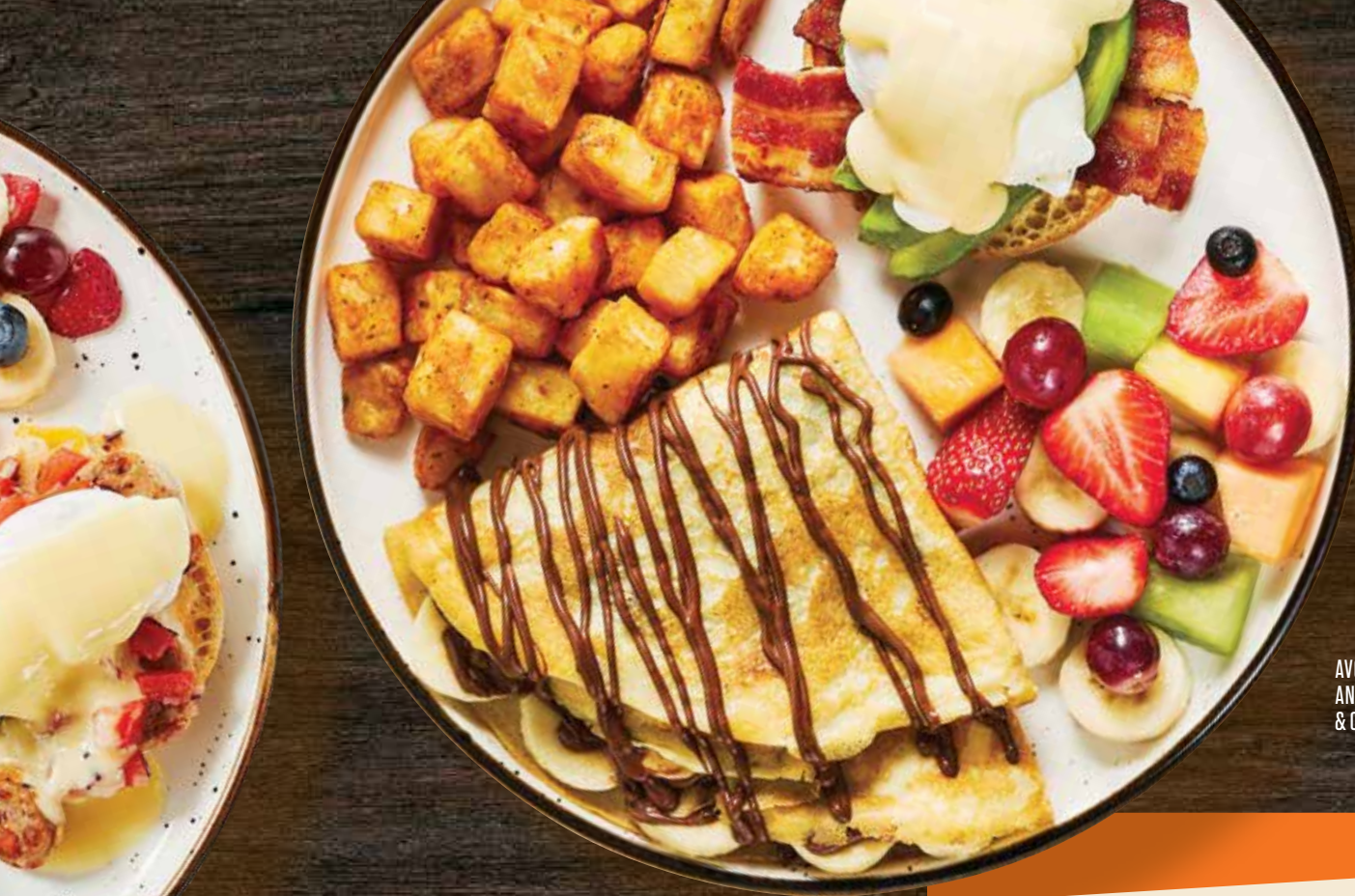
AVOCADO BENEDICT AND BANANA & CHOCOLATE CREPE