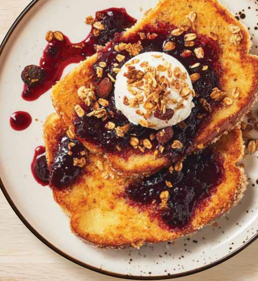
MASCARPONE CRISPY FRENCH TOAST & HOMEMADE FRUIT COMPOTE