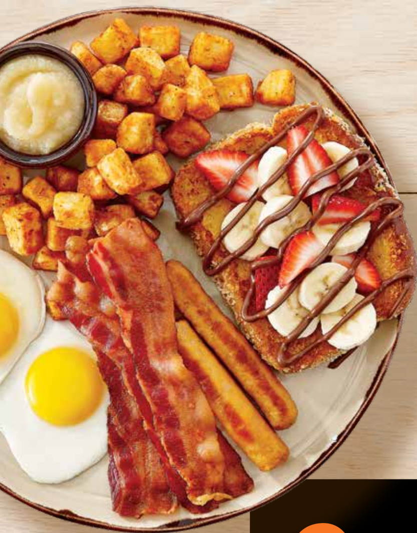
CRISPY FRENCH TOAST COMBO