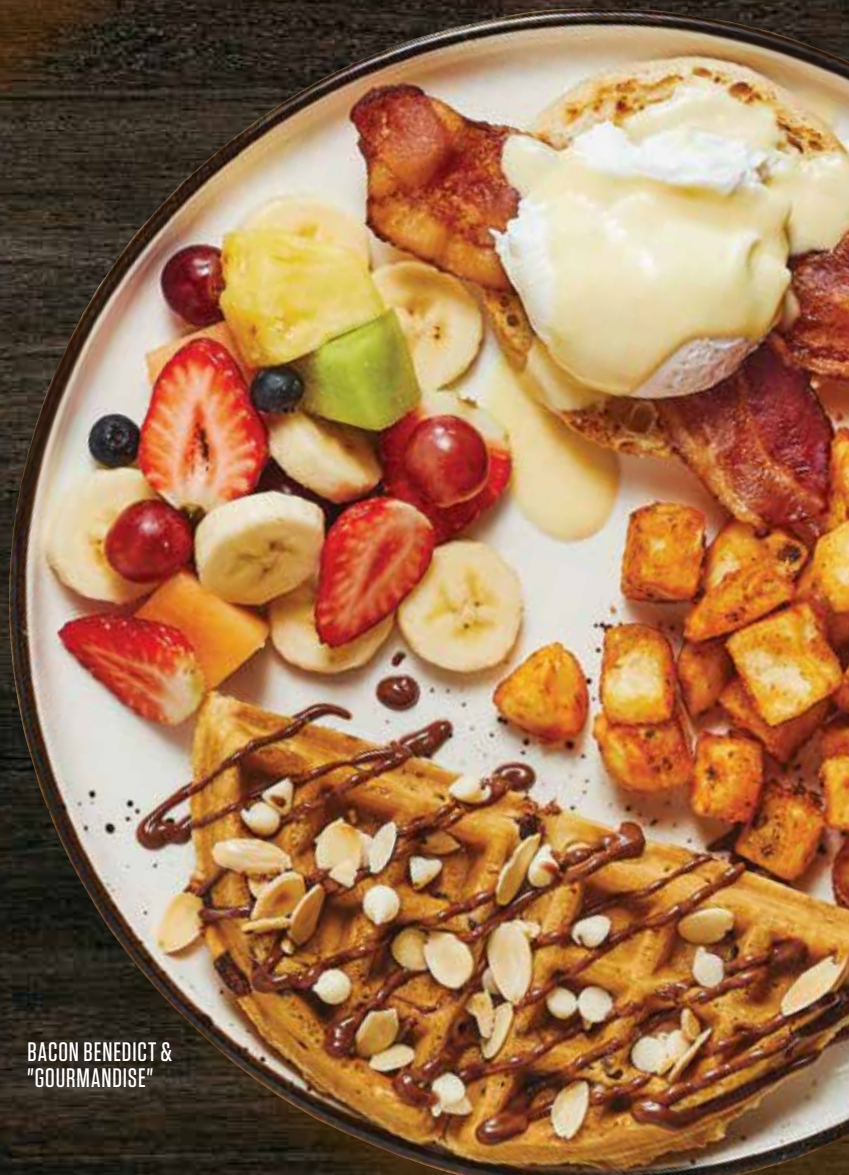
BACON BENEDICT & "GOURMANDISE"

Poached egg, English muffin, bacon, avocado and Hollandaise sauce along with a bananas and hazelnut chocolate crepe